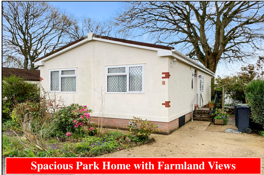
Spacious Park Home with Farmland Views

5 Hillbury Park, Hillbury Road, Alderholt, Fordingbridge. SP6 3BW